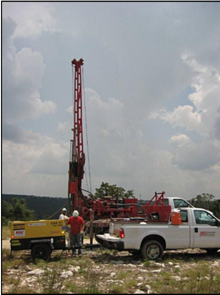
These men would be dwarfed by the 77'7" cross that will be standing in this very location soon.

Therefore, everyone who hears these words of mine and puts them into practice is like a wise man who built his house on the rock. The rains came down, the streams rose, and the winds blew and beat against the house: yet it did not fall, because it had its foundation on the rock." Jesus Christ (Matthew 7: 24)