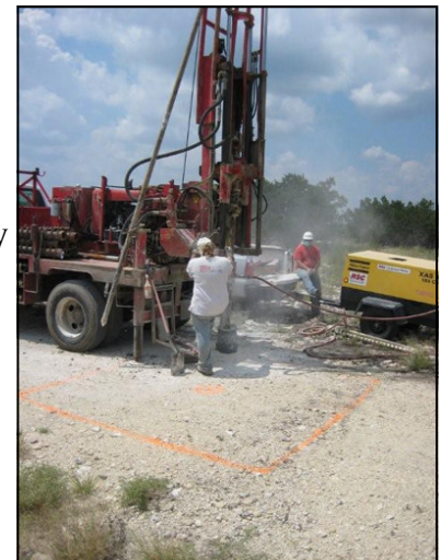
Engineers test the rock. Of course, we know the rock is solid under us.

On Friday, August 31, 2007, PSI , a structural engineering firm from San Antonio, drilled a "core sample" which confirmed what we already believed was true. Indeed, God has placed solid rock at the exact spot where the giant cross will be raised! While soil material is all over 95% of the 23 acres site, God knew we would need a solid formation of limestone rock, as the foundation for the heavy metal cross, at the top of the hill. Photos are included here, which show the "core sample" being taken. Notice that the 77' 7" cross will be about three times the height of the drilling rig. The 10' x 10' cross "foot print" can be seen in one photo, marked out in orange paint on the ground.